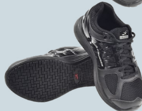
Pro Mesh Black