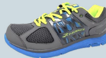
Ross Dk Grey/Blue/Green

The women's shoes also available in 11.5 & 12.5 while supplies last