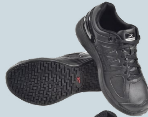
Pro Leather Black