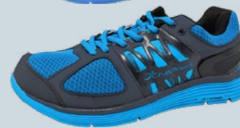
Noble Dk. Grey/Blue