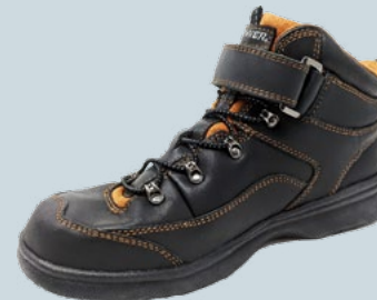
Pioneer Black, Caramel