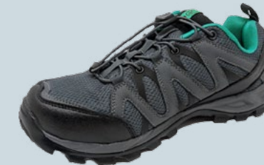
Explorer Black, Grey, Teal